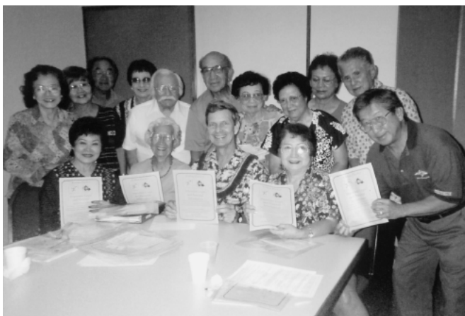
The Law School's Elder Law Clinic Helping Hawaii's Seniors

The Law School was one of the first in the nation to require its students to provide 60 hours of "pro bono" (free) public service before graduation. Many student organizations stress public service and actively contribute to the community through their programs and activities.